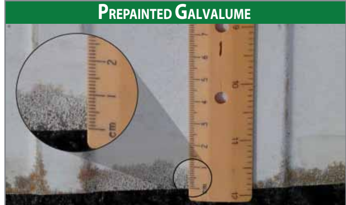
Comparison of drip edge corrosion on a 20 year old building in severe acid rain environment, Pennsylvania.